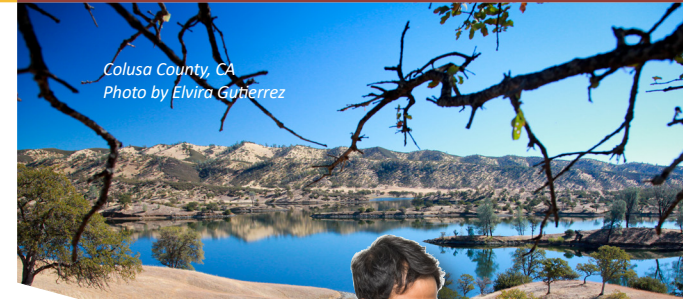
Colusa County, CA

The GSFA Member County "Assist-to-Own" program provides down payment and closing cost assistance (DPA), up to 5.5% of the Mortgage Loan Amount, combined with attractive interest rates for the Mortgage Loan itself.